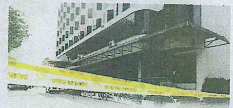
ANGGOTA polis menutup sekitar pekarangan pusat kuarantin di bandar raya Kuching.