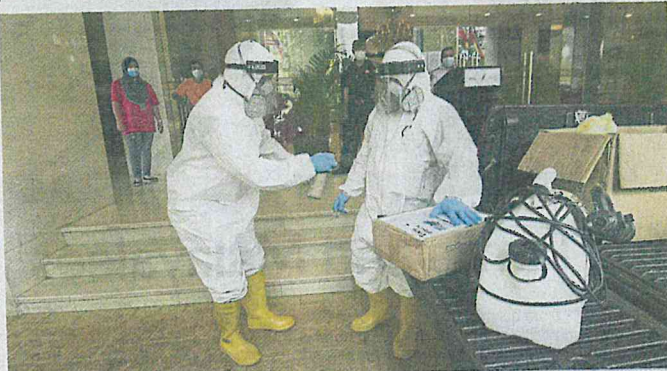
Preventive measures: Two men preparing to disinfect a hotel near the Selangor Mansion and Malayan Mansion flats in Kuala Lumpur on Day 27 of the MCO.

PETALING JAYA: Today marks the end of the first four weeks that Malaysia has been under the movement control order (MCO). Although close to a month has gone by since the introduction of rules to curb the spread of Covid-19, health experts are divided on whether the country has seen the peak of the disease, which had resulted in 4,817 confirmed cases as at noon yesterday. Universiti Sains Malaysia medical epidemiologist and biostatistician Assoc Prof Dr Kamarul Imran Musa believes that the actual number of Covid-19 cases in Malaysia is higher right now - as much as four to 10 times more than the number of confirmed cases - because there are asymptomatic cases (people infected with the virus but do not have symptoms of the disease) that are not being tested. "The peak of infection reflects the highest rate of the spread of the virus, but it is very unlikely we would see a classic pointed peak of Covid-19 spread in Malaysia. "This is because the number of new confirmed cases hover between 110 and 200 daily and the spread of the infection in the community has stabilised," he said. Dr Kamarul added that Malaysia