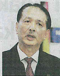
DR NOOR HISHAM

Beliau berkata, sehingga semalam, seramai 20 individu telah dikenal pasti berada dalam kluster itu. “Sebanyak 14 daripadanya sedang dirawat di wad Hospital Tengku Ampuan Afzan (HTAA), Pahang; dua telah sembuh dan tiga dirawat di unit rawatan rapi serta seorang telah meninggal dunia (kes ke-1,575),” katanya. Menurutnya, kes indeks iaitu kes positif ke-4,684 bagi kluster ini mempunyai sejarah perjalanan ke Bali, Indonesia. “Dia mempunyai kontak rapat dengan kes ke-1,575 iaitu abang kepada kes indeks.