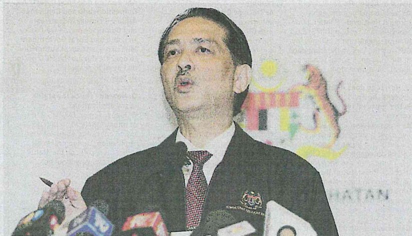
Health director-general Datuk Dr Noor Hisham Abdullah speaking at a press conference in Putrajaya yesterday.

Up to 6pm yesterday, 168 more patients had been discharged, bringing the number of recover-